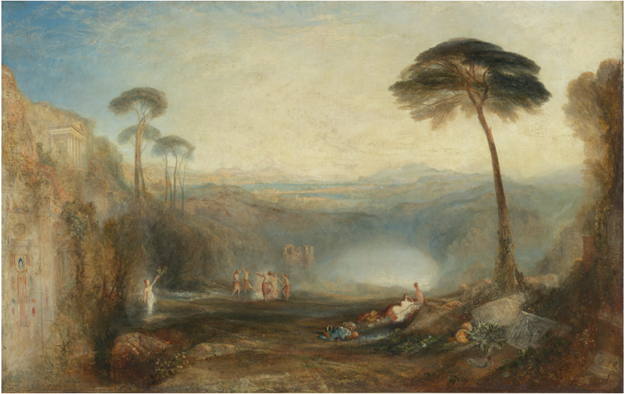
Joseph Mallord William Turner, The Golden Bough - 1834

with an outstanding selection of watercolours and works on paper dedicated to Lake Como, exhibited in Italy for the first time. The exhibition pathway brings together the studies made by Turner during his first Italian journey in 1819, his small vignettes for the illustrated edition of Samuel Rogers' poem Italy (1830), and his later chromatic experiments, in which the landscape tends to gradually dissolve in a vibrant, luminous atmosphere. The exhibition is accompanied by the immersive film JMW Turner: On the Wing , produced by Tate, which conveys the artist's European journeys in a highly sensory and captivating manner. The Pinacoteca Civica features a display of important oil paintings showing how Turner's Italian experience was translated into sublime images in a large format. In works like The Golden Bough and The Sun of Venice Going to Sea ,