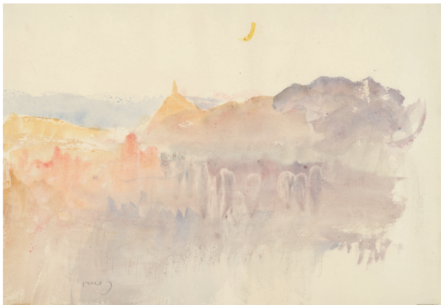
Joseph Mallord William Turner, Como - 1843